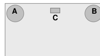
Figure 1: Connectors and setting

EFIS do not require any software configuration; you may reconnect MCP power supply and start it up, the MCP will scan the line and will detect the EFIS selector/s.